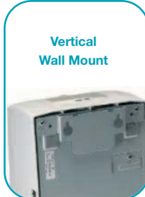
Vertical Wall Mount