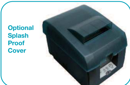
Optional Splash Proof Cover