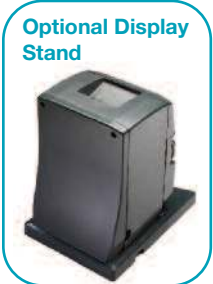
Optional Display Stand