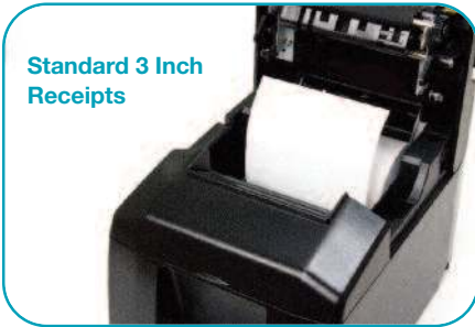
Standard 3 Inch Receipts