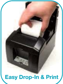
Easy Drop-In & Print