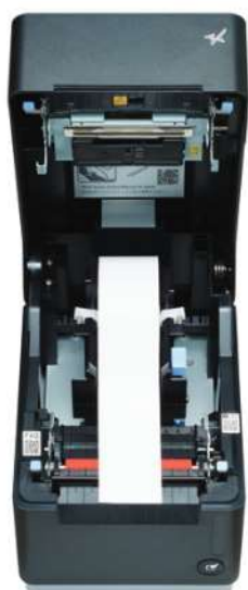
Adjustable label widths

The spindle-less drop-in roll holder and roll position sensors simplify label loading with label widths automatically reported to the host.